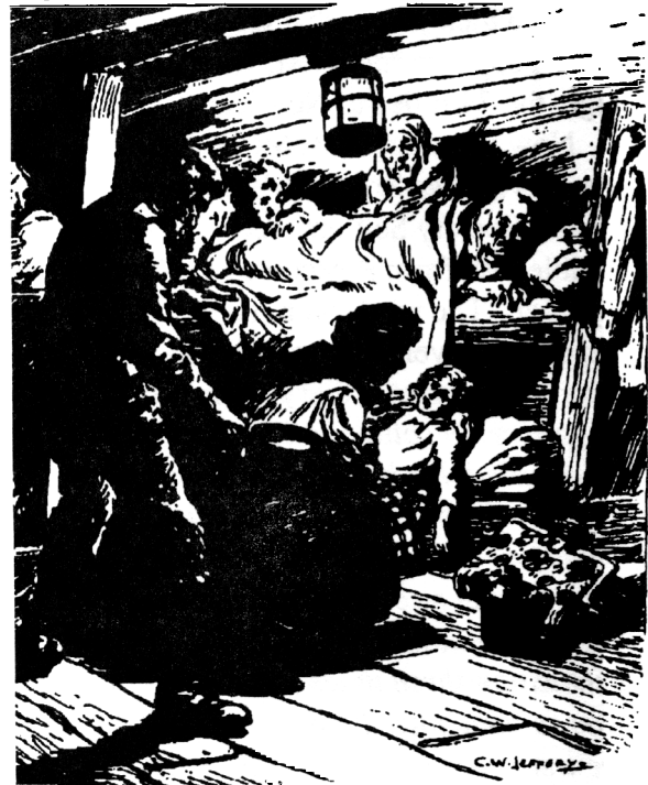
Cholera on board an immigrant ship of the 1830s